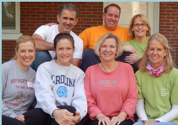
Volunteers from Vanguard. Thank you for participating in our fall cleanup. Our property in West Chester, serving our pre-senior population, never looked better!

We are so grateful for our volunteers and we are looking forward to working with you again!